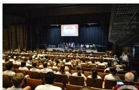
St. Peter's College Brisbane

I was very happy with the concert - it was easily the most musically superior concert we've held.