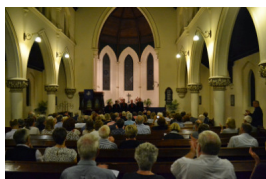
German Church Melbourne