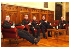
The Chapter House Melbourne